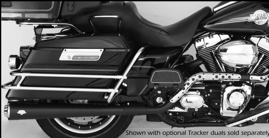
Shown with optional Tracker duals sold separately

Congratulations, you have purchased the finest exhaust system for your motorcycle on the market. Your Vance & Hines exhaust system is designed and crafted for maximum performance, a perfect fit, a great sound and unbeatable style. Please follow the installation instructions below and if you have any questions, please call our technical support line at (562) 926-5291.